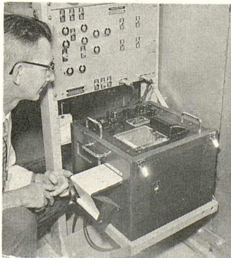
Pengraph recorder and test panel at the hotbox detector location aid maintainer in detector preventive maintenance.